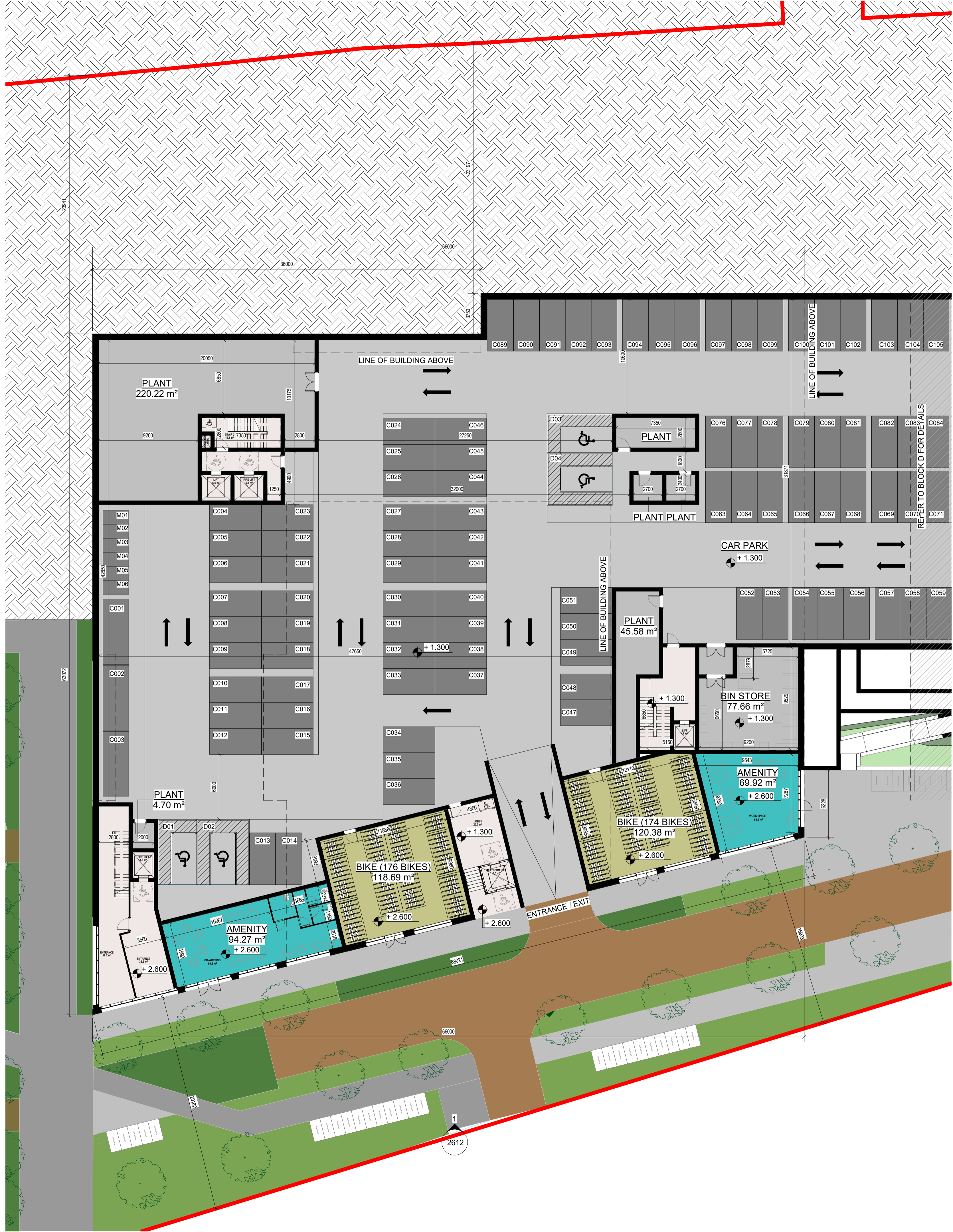
1 PLAN - BLOCK F - LEVEL LG 1 : 200

Please consider the environment before printing this sheet